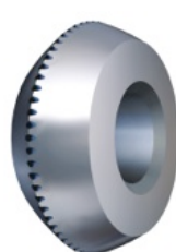
Notched cutting wheel on this Glass Cutter