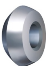
Regular cutting wheel on other glass cutting tools